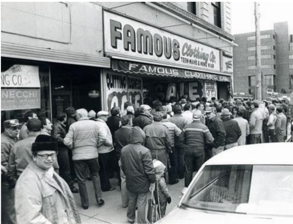
Crowds gather just before the 9 a.m. opening of Famous Clothing's going-out-of-business sale on Nov. 17, 1983.